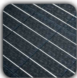
— Product details —